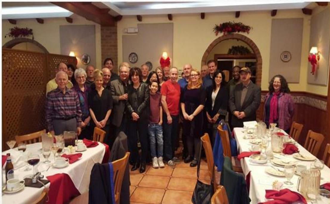
December 2015 Holiday Party at Spain 92