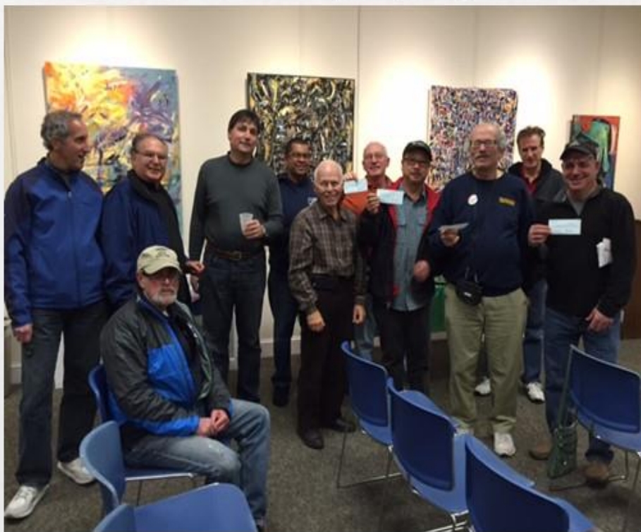
Award Winners & Attendees at December Meeting